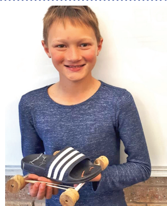
The Grade 5s had to design an elastic-driven car in Technology - here are some of the coolest models.