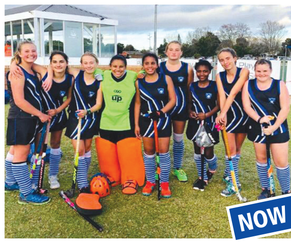
When our U13A hockey girls played in a tournament in George on Friday, it hailed the very last match in their primary school careers. Pictured here, too, are many of the same girls playing in one of their first matches at Plett Primary as tiny Grade 1s. Wow, how time flies?!