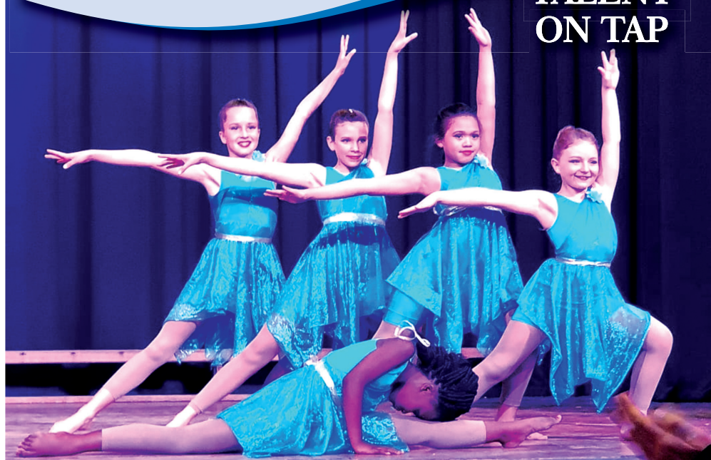
These images show the diversity of our Plett Primary has Talent show held last Wednesday night.